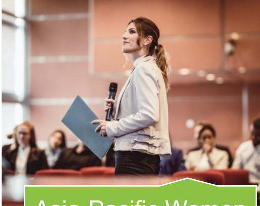
Asia-Pacific Women in Leadership