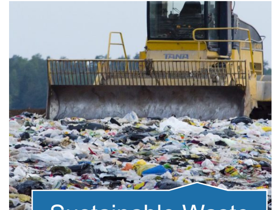
Sustainable Waste Management